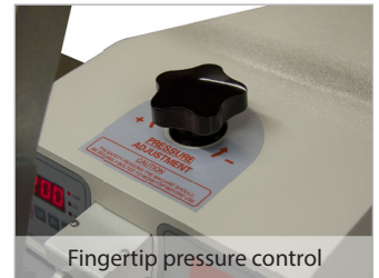
Fingertip pressure control