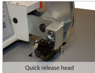
Quick release head